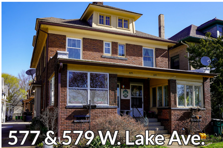
577 & 579 W. Lake Ave.

Information is believed to be accurate but not guaranteed. KIKO Auctioneers