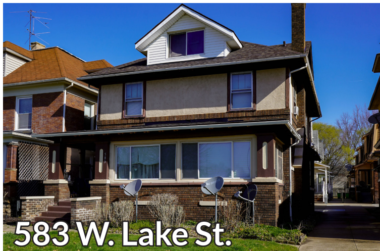
583 W. Lake St.